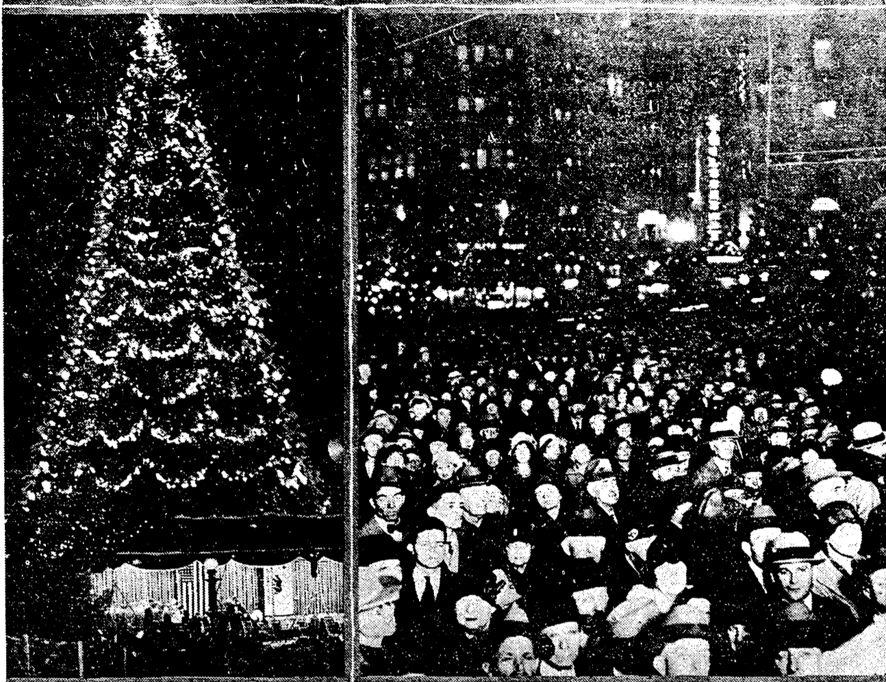
Myriads of colored lights cast their soft glow over Union Square last night when San Francisco's official Christmas tree was dedicated during ceremonies attended by Santa Claus Mayor Rolph and other notables. At the turn of a switch thousands of vari-colored lights burst into glow to the applause of the throngs. At the upper right is pictured a small portion of the crowd which witnessed the holiday ceremonies. At the left is the official Christmas tree.

pieces is representative of a group of church troops: Wesley Methodist, St. Peter's Episcopal, St. Stephen's Episcopal, First Methodist, Trinity Episcopal, All Saints Episcopal, Hamilton Methodist, Calvary Presbyterian, Trinity Methodist, Temple Emanuel, Lebanon Presbyterian and St. Dominic's Catholic. The band program will include "Heraldic March," "Gloria of the Trumpets," selections from "The Chimes of Normandy" with solo by