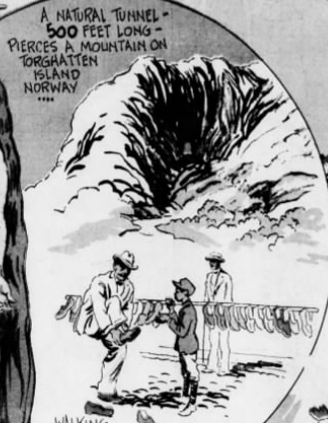
A NATURAL TUNNEL - 500 FEET LONG - PIERCES A MOUNTAIN ON TORGHATTEN ISLAND NORWAY...